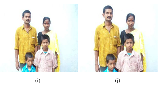
Figure 3. Duplicate Household Ration cards